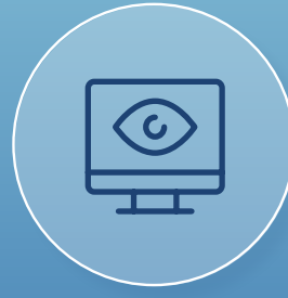
SECURITY AWARENESS TRAINING